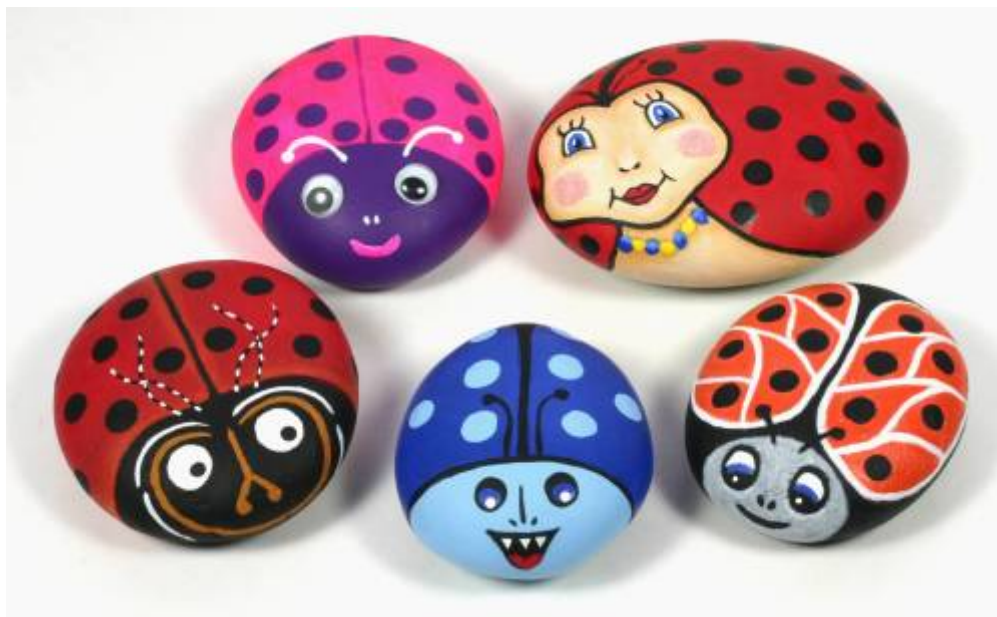
Photo 15 Various colors, patterns and face ideas