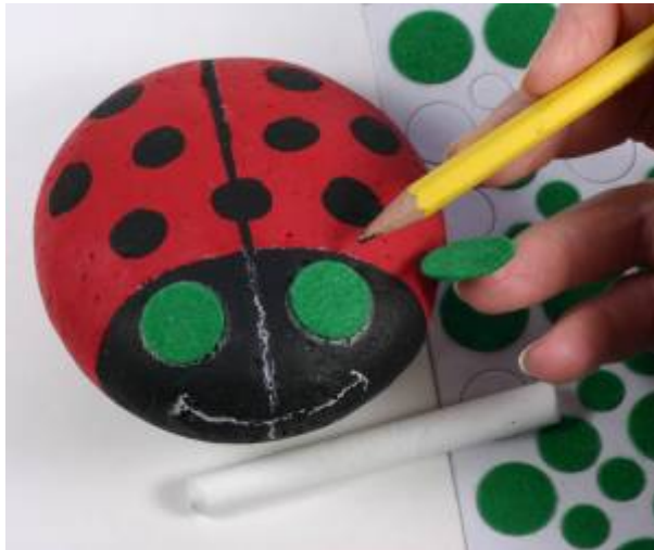
Photo 10 Sketch face with chalk and use felt circles for eye templates.

9. With chalk, draw a line down the center of the face, dividing it in half. This will help you get an even placement for the eyes, nose and mouth. Sketch the mouth with chalk. Photo 10