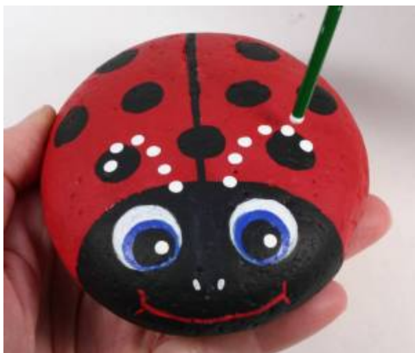
Photo 13 Add dots to eyes and antennas with the end of a paintbrush