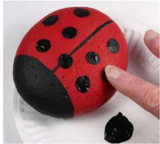
Photo 9 Apply dots to the body.

8. Press finger on the rock where you want the dot, then lift off. Dip your finger into the paint for each dot. Photo 9