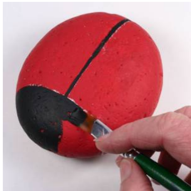
Photo 7 Paint the head black.

5. With chalk, sketch the head shape and a line down the center of the body. Photo 6