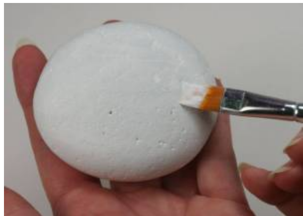
Photo 3 Basecoat your rock white.