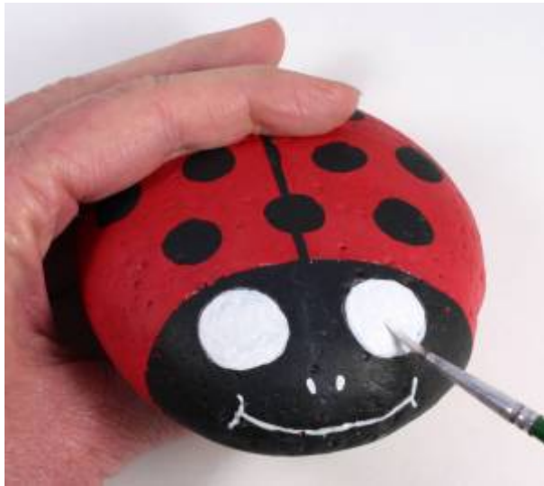
Photo 11 Paint eyes, nose and mouth white.

11. Remove the felt if used and paint the inside of the eyes white with a small round or flat brush. Apply two or three coats for solid coverage. Photo 11