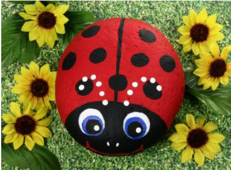
Photo 14 Ready to display

You can make ladybugs in all colors and patterns. The pink and purple ladybug in the photo has goggle eyes glued on, making it an easy way for young kids to add eyes to their ladybugs. Photo 15