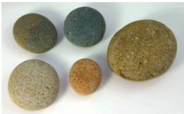
Photo 2 Ladybug shaped rocks.

1. Small round or oval rocks are the perfect shape for ladybugs. For this project, I used the larger rock. You can paint them yellow, orange, purple, pink, gold or just about any color you want. Photo 2