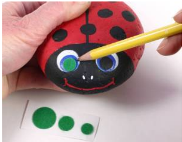
Photo 12 Paint blue and black circles inside the eyes.

16. Paint the mouth line red with a liner brush. Photo 12