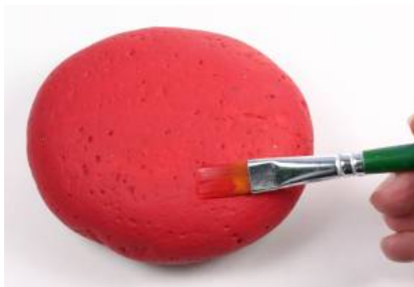
Photo 4 Apply 2 or 3 coats for solid coverage