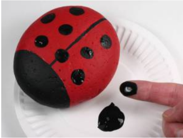
Photo 8 Dip finger in black paint

7. Apply black dots to the body. Paint them with a round brush, or use your finger as in the reference photos. Pour a fresh puddle of black paint and dip your finger tip into the paint. Photo 8