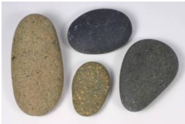
Photo 2 - Shapes for bees are round, oval or teardrop