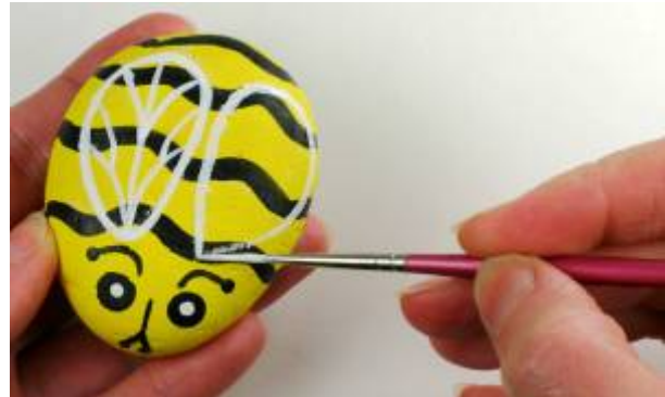
Photo 14 – Outline the wings with paint

With chalk, sketch the wings on. Photo 13